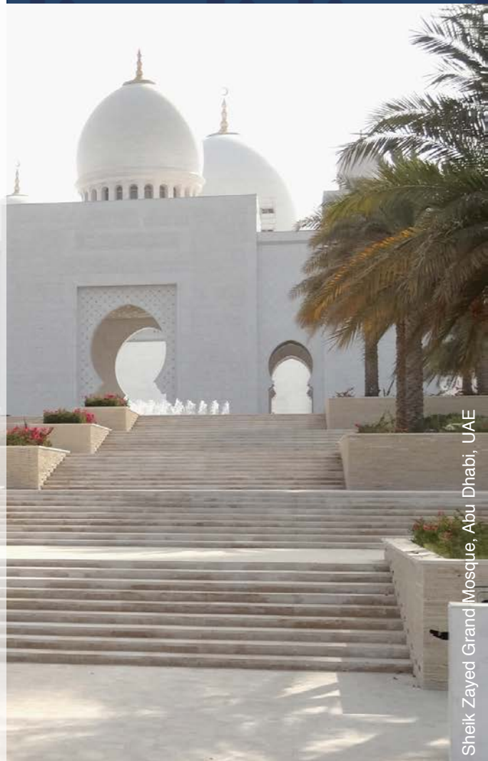
Sheikh Zayed Grand Mosque, Abu Dhabi, UAE